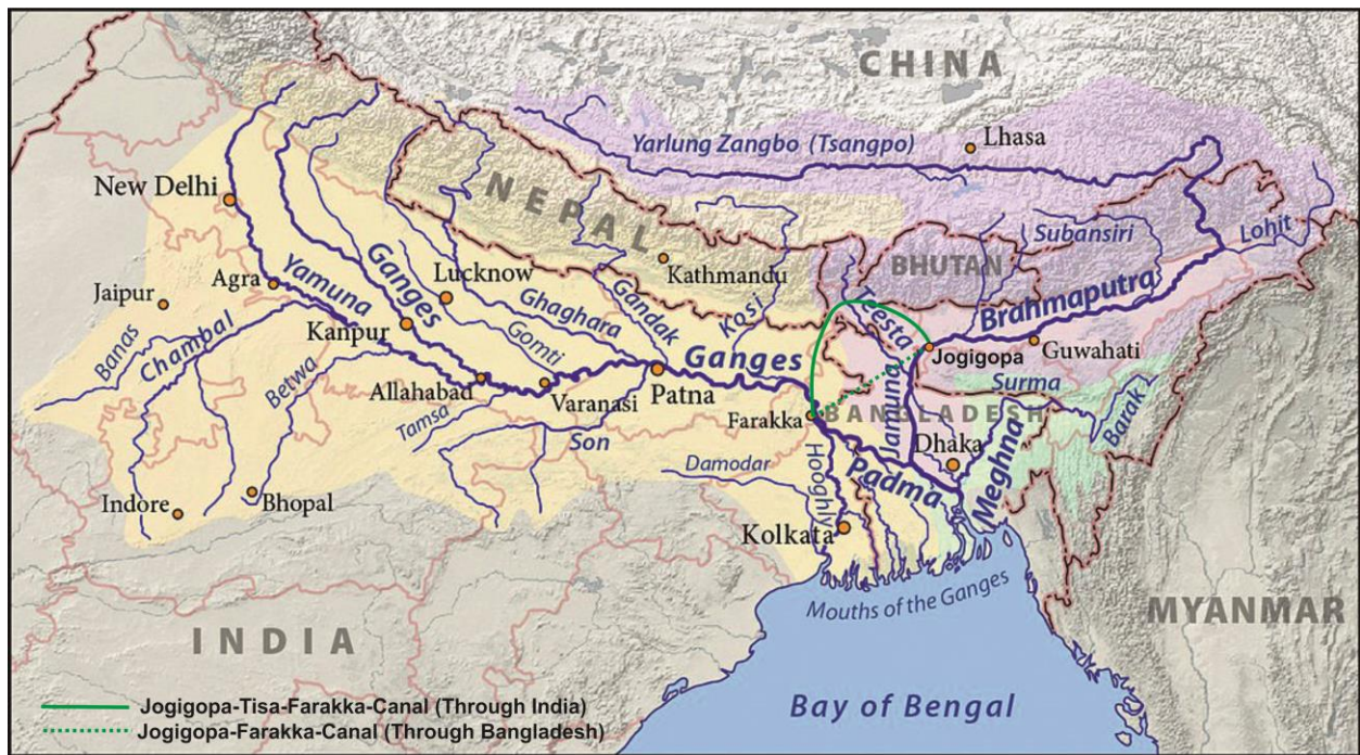
Fig.2 Ganga - Brahmaputra Link Through Bangladesh(Green dotted-- ) and Jogigopa-Tista – Ganga Through India (Green Full Line - ) with Storage Dams on Brahmaputra Tributories: Sankosh, Manash, Subansiri, Dihang, Lohit, and a Barrage at Jogigopa

firm water supply, especially during lean season. Although the project started in 1975, it is yet to be completed partly due to land acquisition problem and also due to inadequate lean season flow to meet demand of a huge command of 9.22 lakh ha on firm basis.